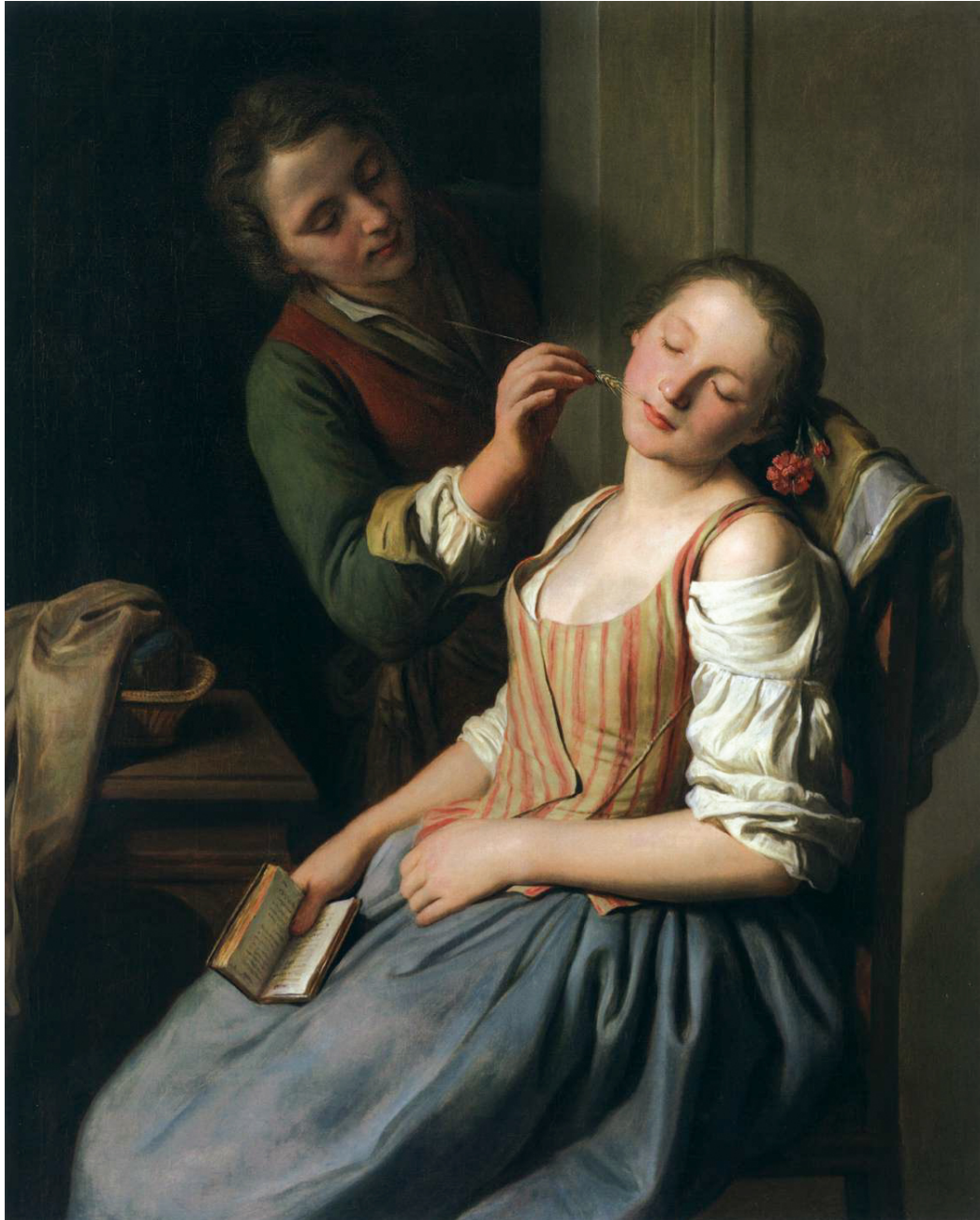
Pietro Antonio Rotari, "Sleeping Girl with Her Beau" (1750-55), oil on canvas, 106 x 84 cm. Alte Pinakothek, Munich